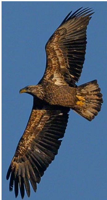
Left – Very dark 4 th year bird in Jan Below, center – 4 th year bird in 4 th spring

Fourth-Year Bald Eagles – Bald eagles are especially variable during the 4 th year as individual birds progress faster or slower toward full adult plumage.