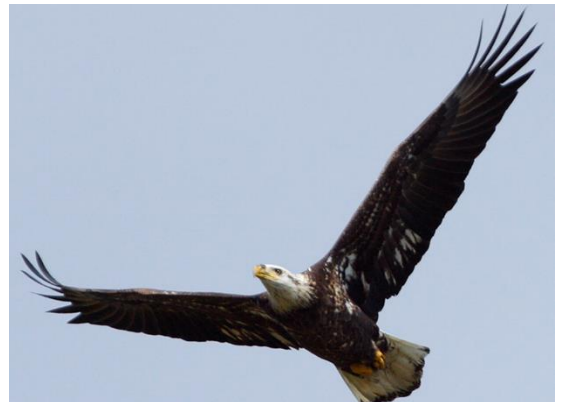
Above – another 4 th year bird